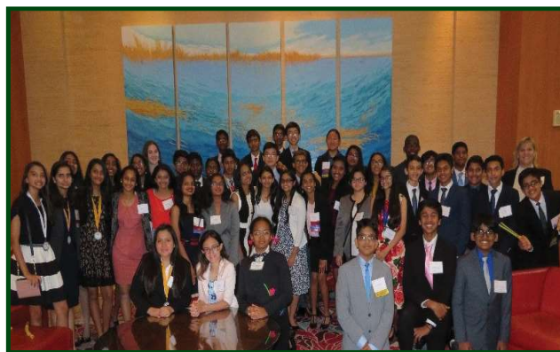
Williams Future Business Leaders of America – One of the largest in the state of Florida

The total educational experience at Williams Middle Magnet School aims to increase students' self-awareness, promote a greater understanding of the students' connections and relationships with the world, and intertwine the threads of human experience.